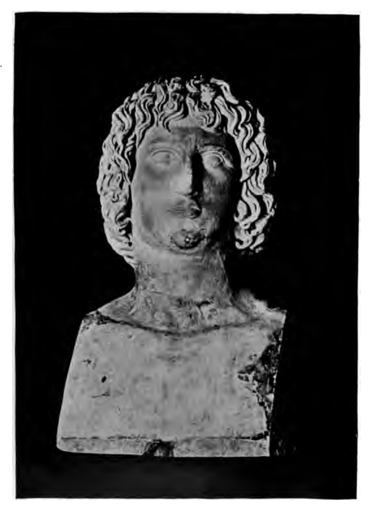
VIRGIL, FROM A BUST IN THE CAPITOL AT ROME.